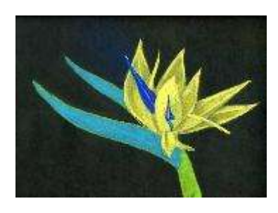
9. Add white highlights to the dark blue petals with a white pastel.