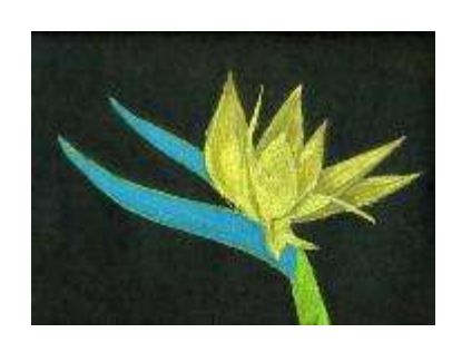
6. Now go back over those violet shadows with a darker yellow pastel.