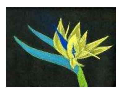
8. Using a dark blue pastel, draw in the dark blue petals.