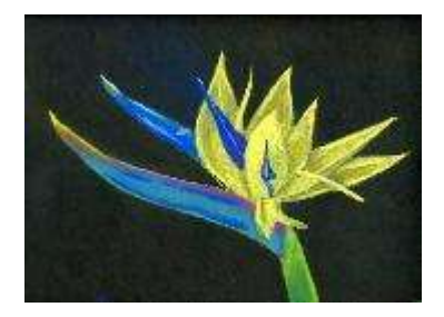
10. Now look carefully at the leaves in the photo reference and note all of the various colors in them: dark blue, yellow, green and red. Add these colors to the leaves as you see them in the photo reference. You may smudge these with the tortillion if you wish.