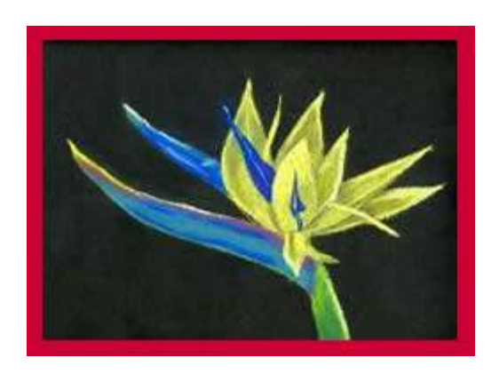
12. You may wish to mount this drawing onto another larger piece of red or yellow construction paper.