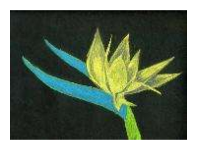
5. Using a dark violet pastel, add shadows to the yellow petals. Look carefully at the photo reference below for the shadows!