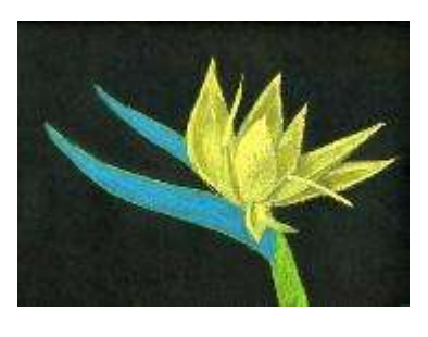
7. Using the lightest yellow pastel you have, add highlights to the yellow petals, according to the photo reference below.