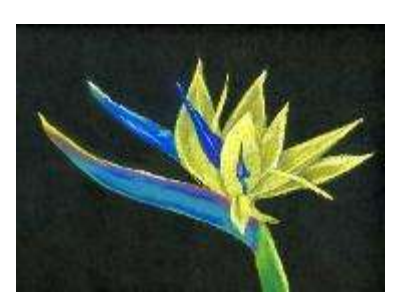
11. Using the sharp corner of a white pastel, add any other highlights you see on the flower. Do not smudge these.