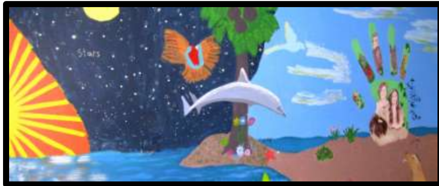
This Creation mural was painted by Masterpiece students in 2008.